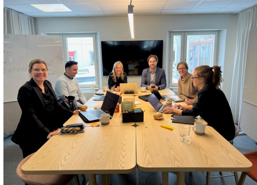
Workshop "Designing Solutions for a Dynamic Future"